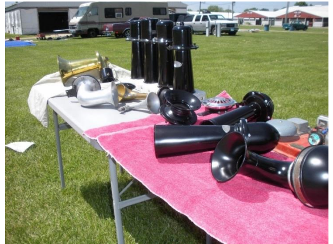
There were horns aplenty at this vendor's table