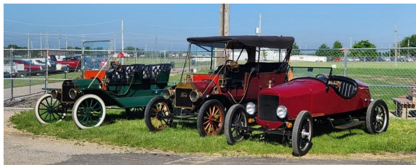
A nice trio of T's: Aaron's 1910 Tourabout, Stiers' 1912 Touring, and Roland's 1926 Speedster

A picture perfect day greeted vendors, spectators, and show cars for the 59 th annual Little Hershey Swap Meet and Cruise-In. The swap meet field had approximately 93 vendors while about 100 cars showed up for the cruise-in and car corral. A