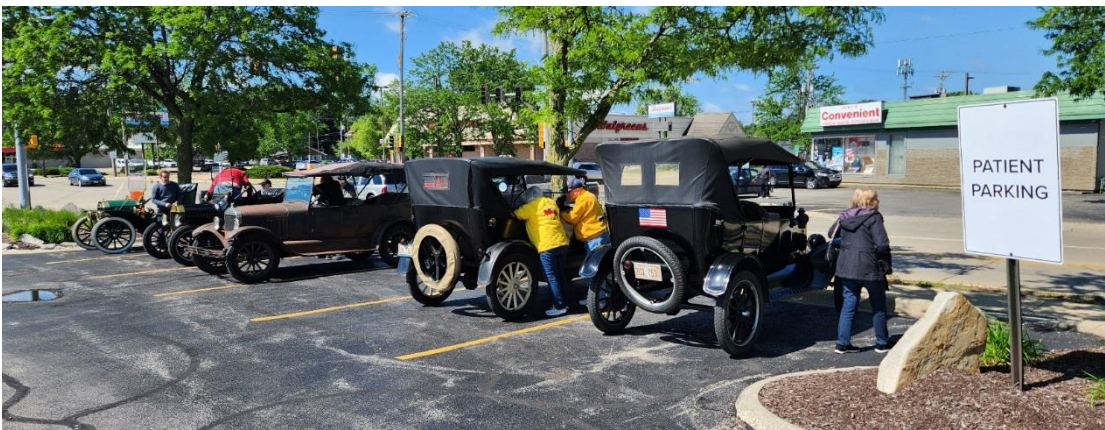
Does the sign mean you should be patient when parking a Model T?