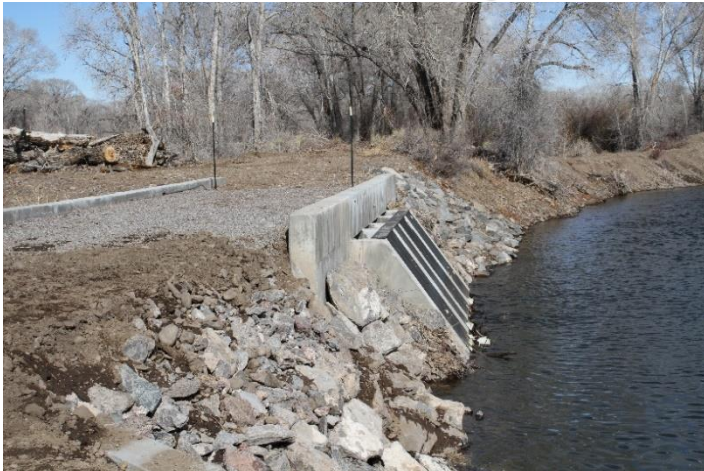
Trash rack at river headgate