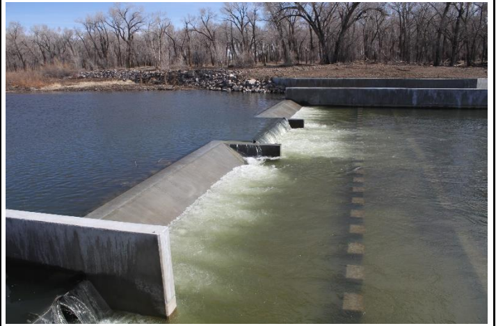
Diversion dam (CONSOLODATED SLOUGH)