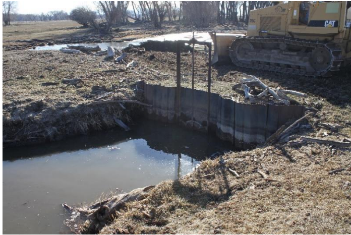
Headgate looking downstream