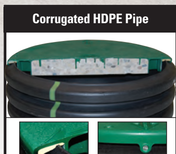
Corrugated HDPE Pipe Water-TITE Joint Horizontal Safety Screws