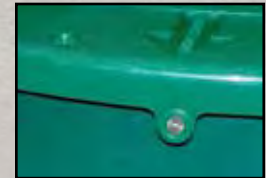
Horizontal Safety Screws