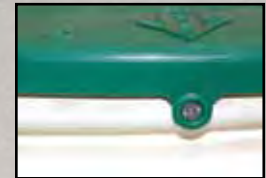
Horizontal Safety Screws