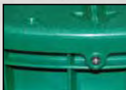
Vertical and Horizontal Safety Screws