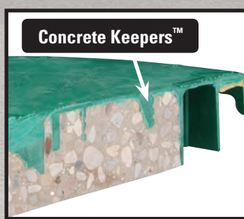
Holds up to 70 lbs of Concrete for Added Safety.