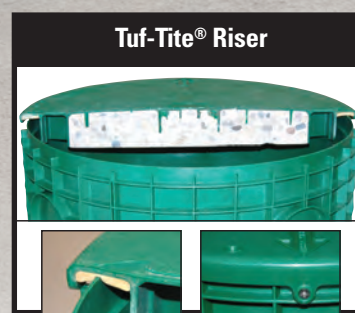
Tuf-Tite Riser Water-TITE Joint Vertical and Horizontal Safety Screws