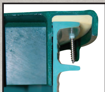
Secured by 6 Vertical and 4 Horizontal Safety Screws. Screws Included.