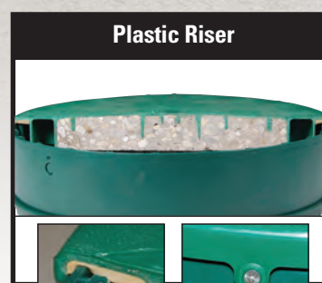
Plastic Riser Water-TITE Joint Horizontal Safety Screws