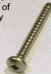
1.75" square drive

All Tuf-Tite Riser Lids come with a choice of stainless steel safety screws.