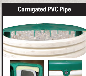
Corrugated PVC Pipe Water-TITE Joint Horizontal Safety Screws