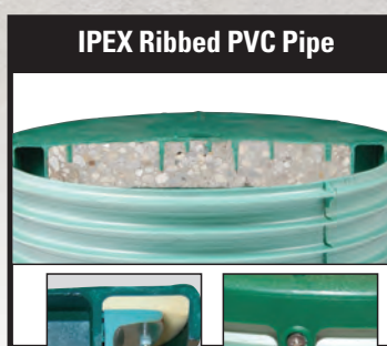
IPEX Ribbed PVC Pipe Water-TITE Joint Horizontal Safety Screws