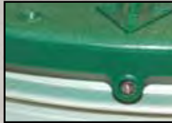
Horizontal Safety Screws