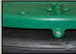
Horizontal Safety Screws