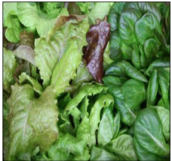
Figure 2: Green lettuce from Leafy Green Machines

The Leafy Green Machine enables us to grow dozens of varieties of lettuce in Figure 2, as well as other herbs and leafy greens including arugula, basil, chard, mustard greens, kale, mint, and others. Such a variety of taste, color and texture, all freshly harvested year round at our local farm. Even better, these greens are delivered very quickly after harvest with the root ball still intact for a very long shelf life.