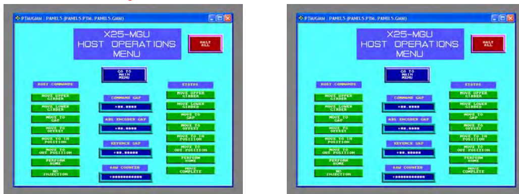
Figure 2: Touch Panel Displays generated by ADC