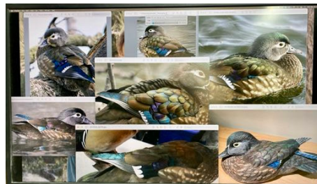
My monitor with reference photos while

A very critical part of being a wildfowl artist. You can't make a duck look real if you don't know what a real duck looks like. The closer you look, the more you see. So the more info you can get on each bird the better your end product will be. The other part of reference is the 'how to' side. Learn from the experts. Fortunately there is a lot of good material available to give you step by step guidance on carving and painting. I've listed some of those that I have found most helpful.