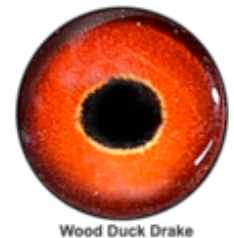
Wood Duck Drake

Glass eyes are available from many sources, but the best eyes aren't just a single color of red, brown, yellow, etc. they are blended colors or banded with a darker circle around the edge. The eyes make a big difference in the finished bird so spend a little more. Eyes run from $3 to $13 per pair. World class eyes are available from Tohickon eyes. Buy them from either tohickon.com or GregDorrance.com . There is a new source for eyes, Fulix.com . by carver Michael R Braun. His eyes look great, with more detail going into each species. They are priced at only $6.00 per pair. fulix365.com