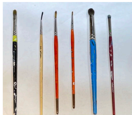
Left to right #6 Cats paw or filbert, 0/5 liner, #2 Raphael Round, 2/0 Raphael round, Large and small blending brushes.