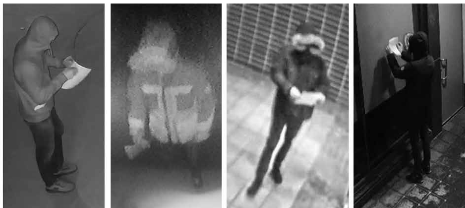
Memorial Cenolaph, Port Perry October 2019 | Diane Hamre Rec Complex, Newcastle November 2019 | Brooklin High School, Whitby February 2020 | Central Whitby Library February 2020

Anonymous information can be sent to Durham Regional Crime Stoppers at 1-800-222-TIPS (8477) or online at www.durhamregionalcrimestoppers.ca and tipsters may be eligible for a $2,000 cash reward.