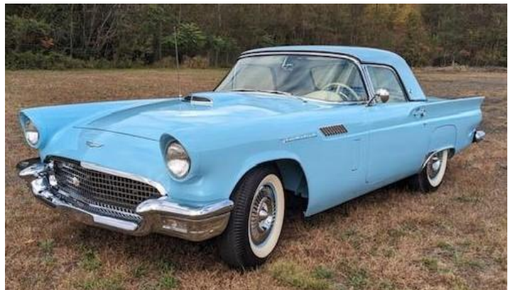
Charles Musto's 57 (Azure Blue F Code)