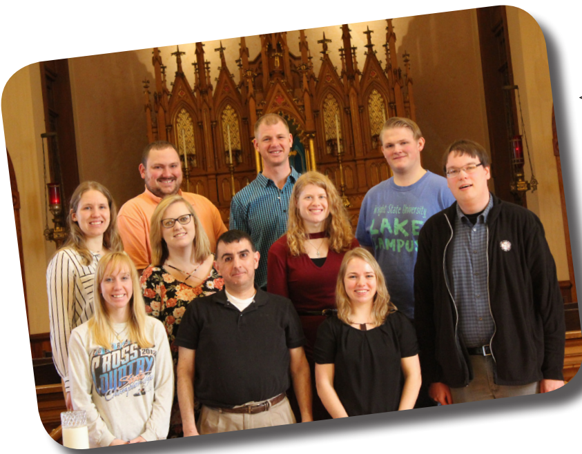
< A few members of the Young Adult Group pictured here.

Young Adults 20-35 are welcome to join the Group for coffee and faith conversation. They meet on Saturdays at 11:00 a.m. in the Gast Gallery on the 2nd floor of the Shrine.