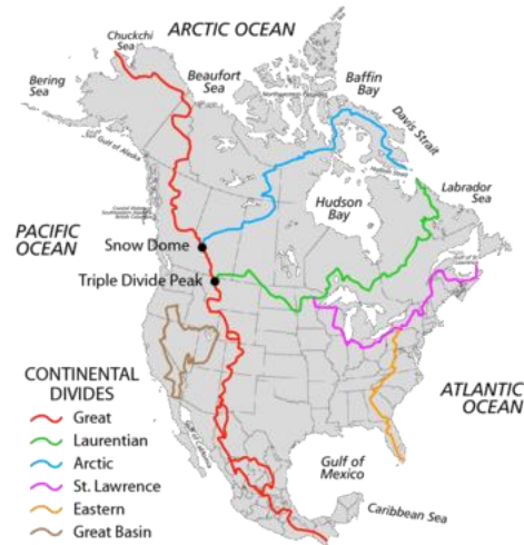
The Great Continental Divide of North America

Fortunately the expedition now comes upon the Shoshones, who happen to be Sacagawea’s native tribe. They know the best routes through the mountains, and guide the way – first across the Lemhi Pass, some 7400 feet above sea level, and then along the Lolo Trail, and the rugged Bitterroot Range. Lewis regards this 200 mile slog as the most challenging of the entire trip, with all members suffering from frostbite and a lack of food.