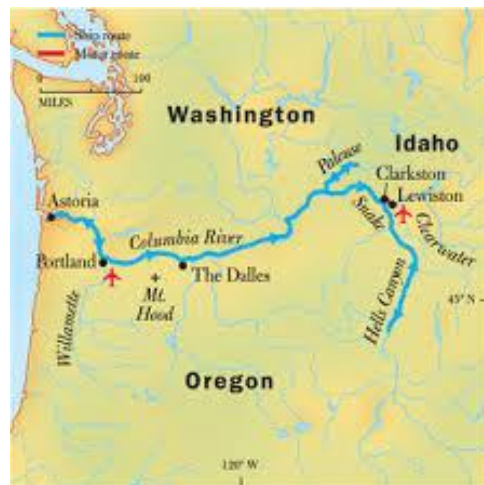
The Columbia River Running Inland from the Pacific

On October 18, 1805, they are elated to spot Mount Hood in the distance, another identified marker on their original map. Roughly a month later they have reached the Pacific Ocean, at Astoria, where they set up winter quarters known as Ft. Clatsop. Using his “dead reckoning” skills, Clark estimates they have come 4,162 miles, a figure that proves to be only 40 miles off the true mark. The elapsed time is 18 months, one way.