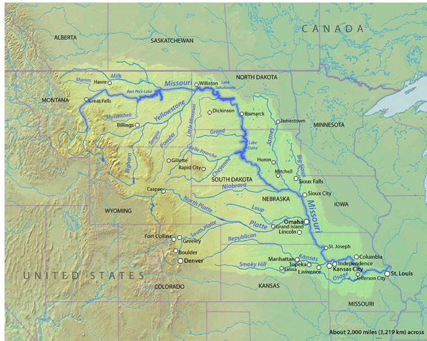
The Mighty Missouri River Stretching 2341 Miles from St. Louis to Three Forks

Only a month later, on August 17, their hopes for a Northwest Passage to the Pacific are over, as they discover the "end point" of the Missouri River, the headwaters at Three Forks, Montana.