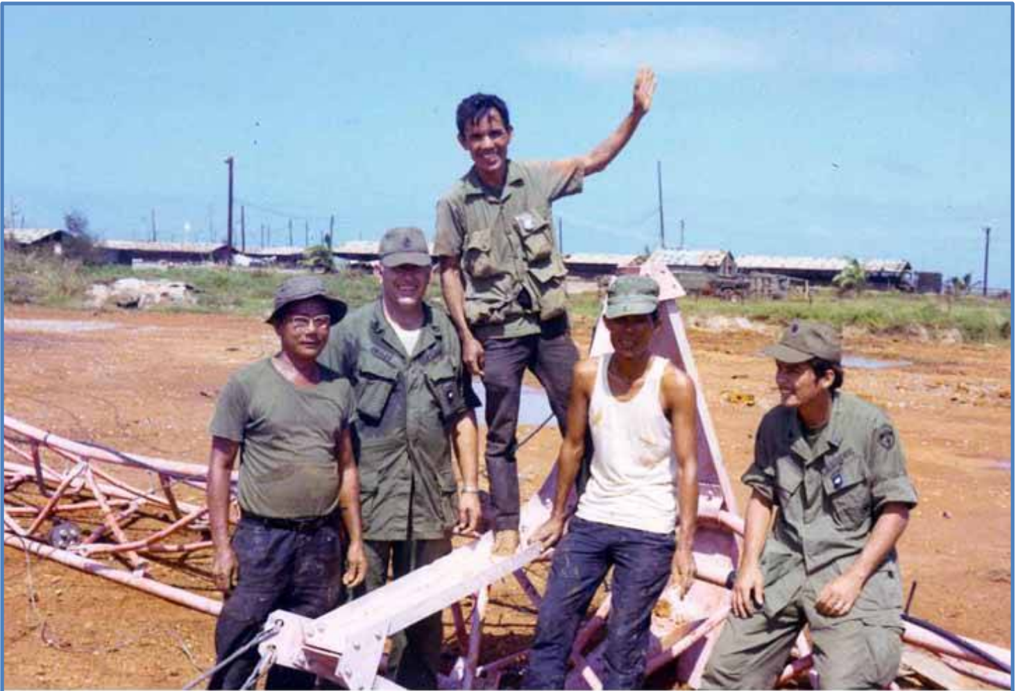
With some of the AFVN "local hire" tower crew taking down the Chu Lai tower.