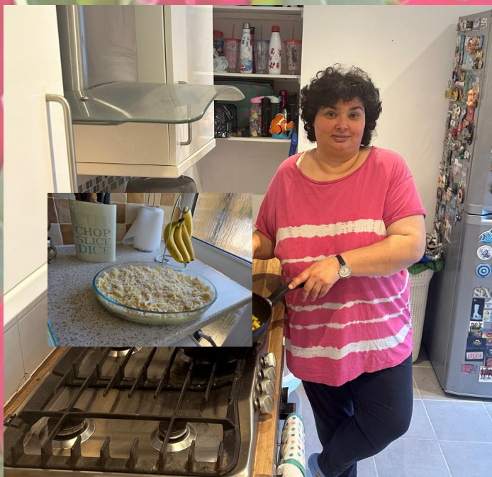
Kim's fresh vegetable stir fry from scratch.