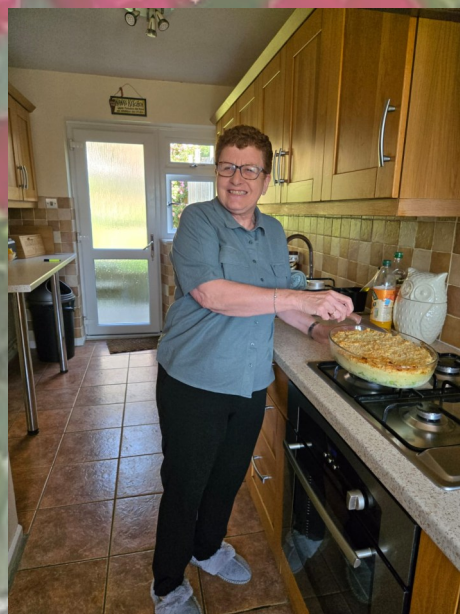
Pauline's extra special fish pie, topped with cheese & bread crumbs & a chorizo sausage pasta bake. Yum Yum...