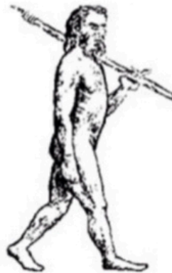
CROMAGNON MAN One of the earliest and best established fossils is at least equal in physical capacity to modern man. So what is the difference?