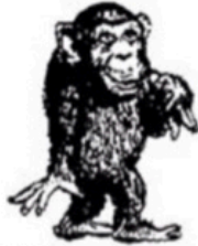
LUCY Almost all experts agree Lucy was a 3 foot tall chimpanzee.