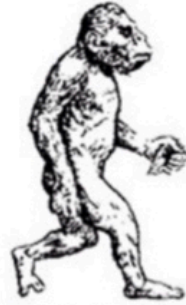
NEBRASKA MAN Scientifically built up from one tooth, later found to be the tooth of an extinct pig.