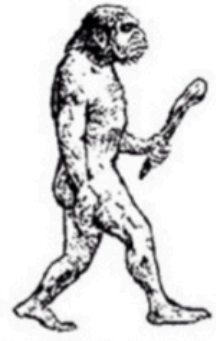
PEKING MAN Supposedly 500,000 years old, but all evidence has disappeared.