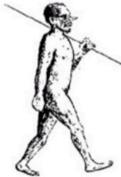
NEWGUINEA MAN Dates way back to 1970. This species has been found in the region just north of Australia.