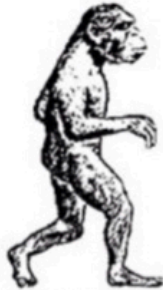
HEIDELBERG MAN Built from a jawbone that was Conceded by many to be quite human