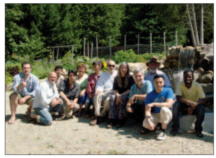
FIGU PASSIVE MEMBERS

ATLANTIS THOROUGHLY ENJOYED CANOEING IN THE PROPERTY'S LAKE