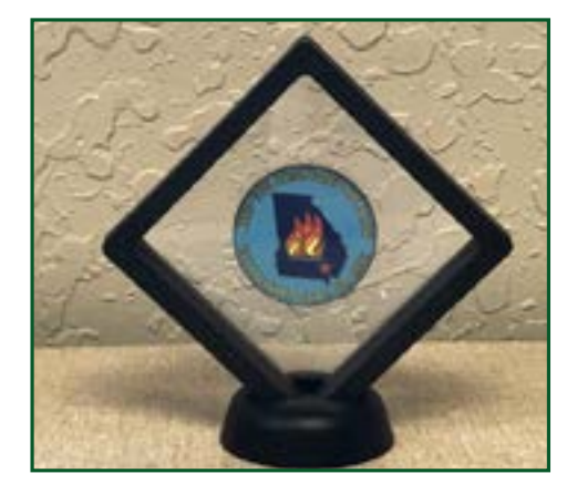
Challenge Coin Back

Full Hookups for RV's were used by the First Baptist Youth Mission Group.