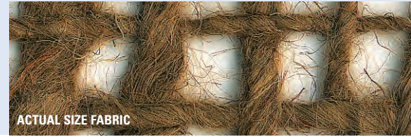
ACTUAL SIZE FABRIC

The Heavy-Duty form of erosion control with an unlimited number of applications: