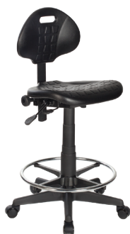
LB-L A : 18" C : 18" - 23" E : 12"