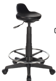
SD A : 13" C : 18" - 23"