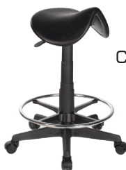
HS A : 16" C : 18" - 23"