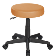
TB-O A : 15 1 / 2 " C : 18" - 23"