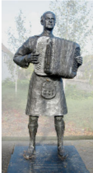
Sir James Shand

Scottish musician famous for "The Bluebell Polka"