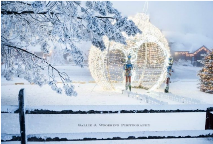
The Beech Mountain Winter Ornament. Great for family photos.