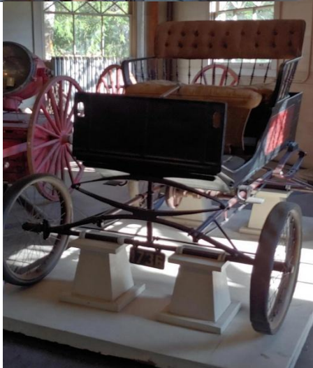
Henry Ford's Quadricycle ??