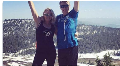
Fly Brave - Sacramento Magazine sacmag.com