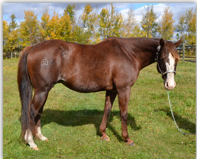
Sweet Fleet Bar at 20 years old!