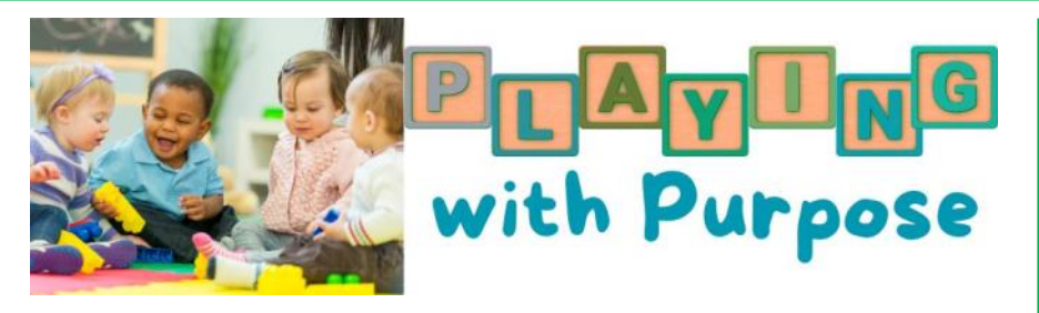
Music Time will be INSIDE the Great Ponds Gallery

NEW Adding WEDNESDAYS at 10:30am, from March 26th through April 30th AND continuing the 3RD SATURDAY of every month at 10:30am: March 15th