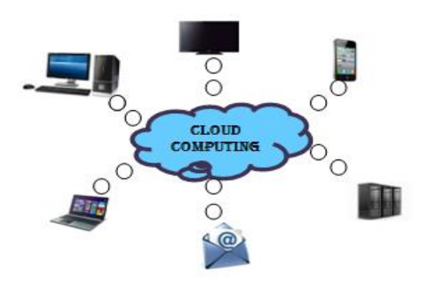
Fig.1: Cloud Computing Environment

A large pool of systems which gather together in a public or private environment for providing resources in a shared manner is known as the cloud computing system. This provides a dynamic scalable infrastructure for the organization as well as the data stored. There is a reduction in the cost computation, application hosting, content storage and delivery with the help of cloud computing technique. There are direct cost advantages achieved due to the utilization of this technique [1]. Also, the data center is to be transformed from a capital-intensive set up to a variable cost environment.