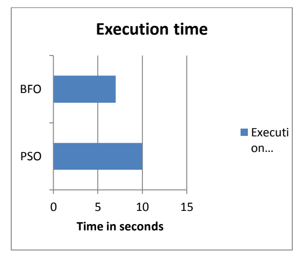
Fig 4: Execution Comparison

As shown in the figure 4, the execution time of the proposed and existing algorithm is compared and it is been analyzed that due to fault recovery in the network , the execution time is reduced in the proposed technique. Execution time= Time at the end of the algorithm- Time at the start of the algorithm – (1)