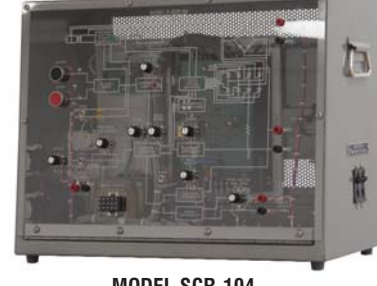
MODEL SCR-104 Dimensions 15"H x 19"W x 9"D Shipping Weight: 100 lbs

Input power is 120V AC, 1Ø, 60Hz, 15 Amps.