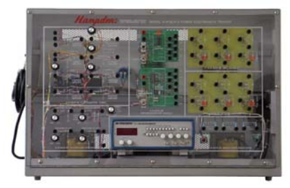
MODEL H-R-SCR-3 Dimensions: 21"H x 32"W x 12"D Shipping weight: 229 lbs

A dual trace triggered 20MHz oscilloscope and a 3Ø AC Motor are OPTIONAL recommended accessories for the Model H-R-SCR-3.