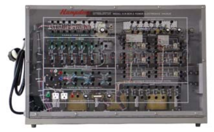
MODEL H-R-SCR-2 Dimensions: 21"H x 32"W x 12"D Shipping weight: 229 lbs