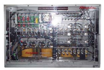
MODEL H-R-SCR-1A Dimensions: 21"H x 32"W x 12"D Shipping weight: 220 lbs