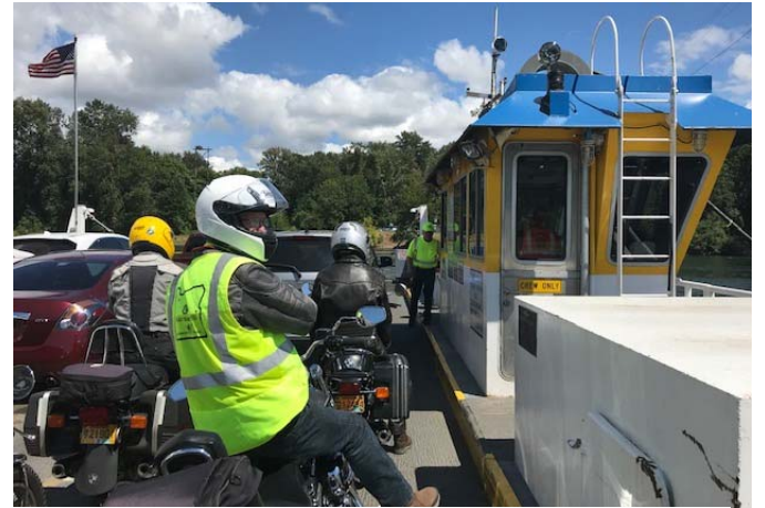
OTC members crossing the Willamette River on the Wheatland Ferry, on June 27 th ride