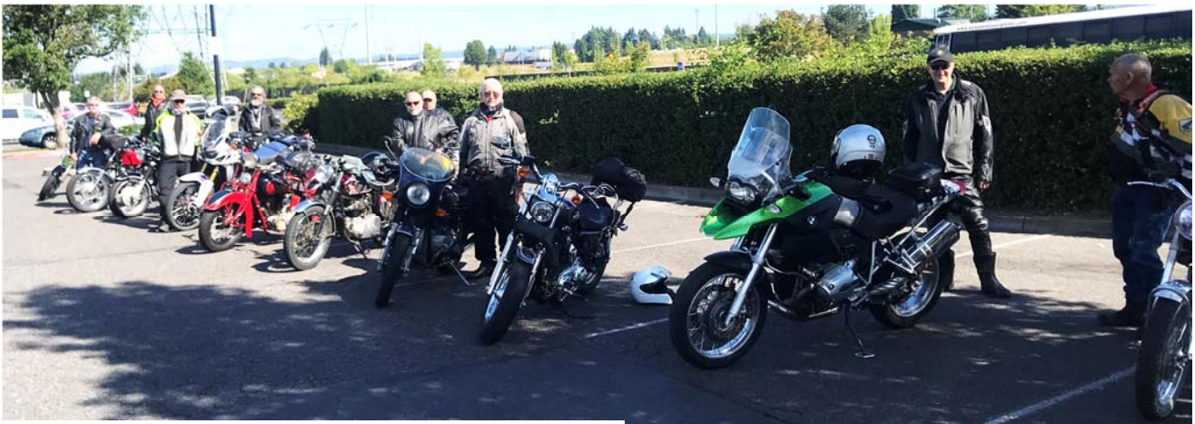
OTC club members and OVM guests assembled for July 18 th