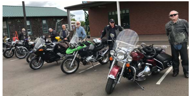
OTC members gather at Powerland for June 27 th ride