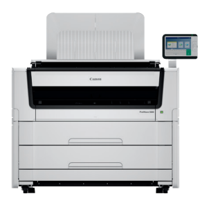
PlotWave 5000 series