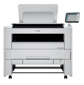
PlotWave 3000 series

Printing from many locations and sources is supported by the PlotWave series. With Publisher Mobile, you can preview and print files from your mobile phone or tablet. With Publisher Express, you can submit print files directly from the web. Driver Select, the printer driver for Windows, helps reduce errors and gives you first-time-right results, with its clear and easy-to-use functionality. Driver Express enables printing PostScript files from Mac and Windows.