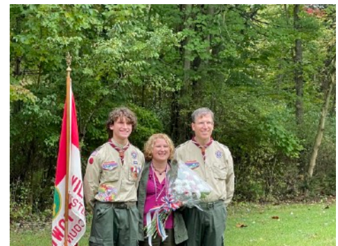
Patrol of the Year: Stag