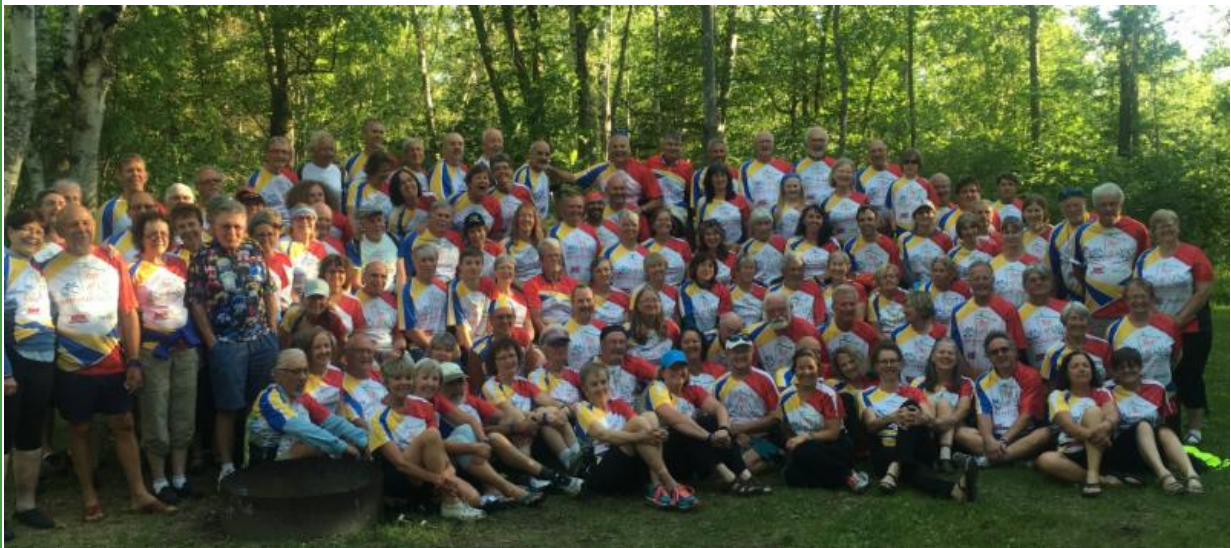
2016 Group Shot at Itasca State Park