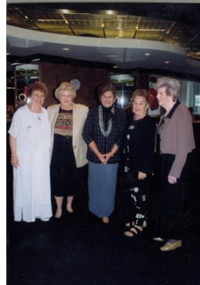
Garden Luncheon 1999