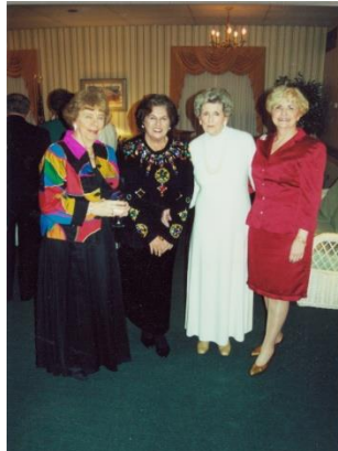
Christmas Party 2009