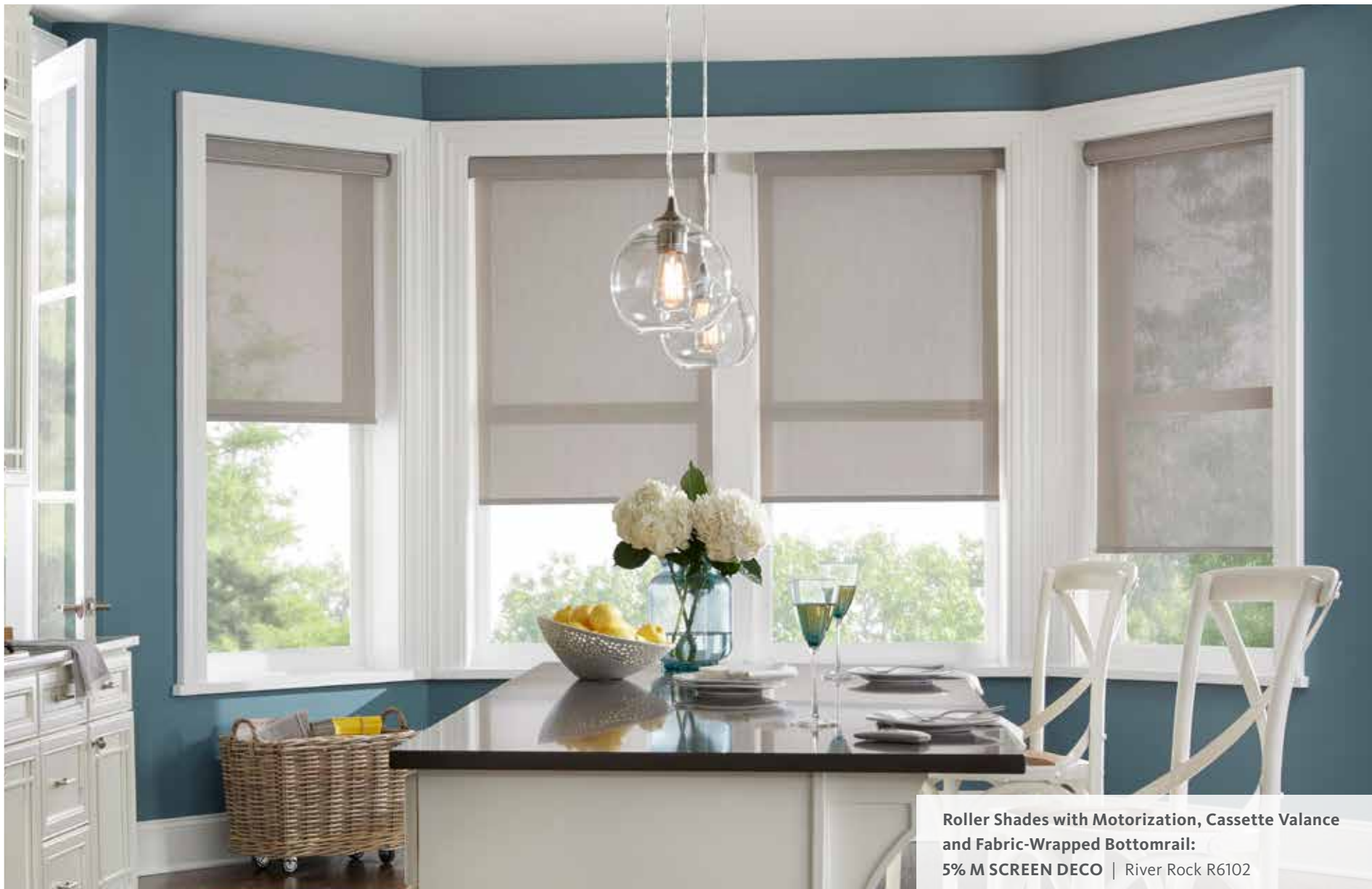
Roller Shades with Motorization, Cassette Valance and Fabric-Wrapped Bottomrail: 5% M SCREEN DECO | River Rock R6102