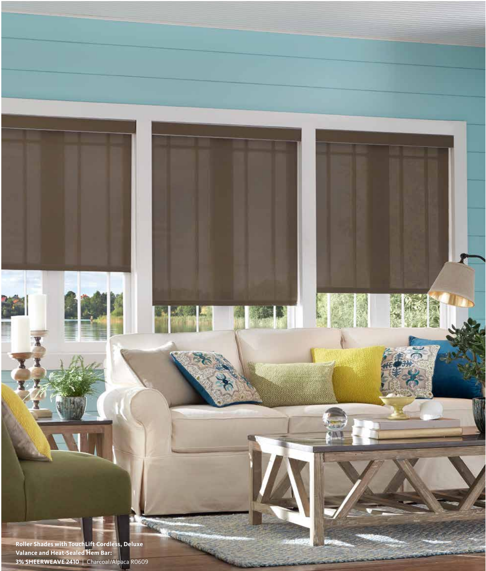
Roller Shades with TouchLift Cordless, Deluxe Valance and Heat-Sealed Hem Bar: 3% SHERWEAVE 2410 | Charcoal/Alpaca R0609