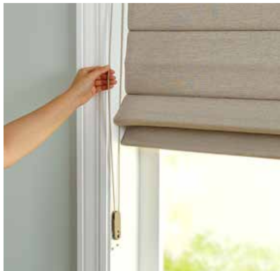
continuous loop control

This system features a locking mechanism to control the position of the shade and comes with cord cleats to help keep dangling cords out of the reach of children and pets.