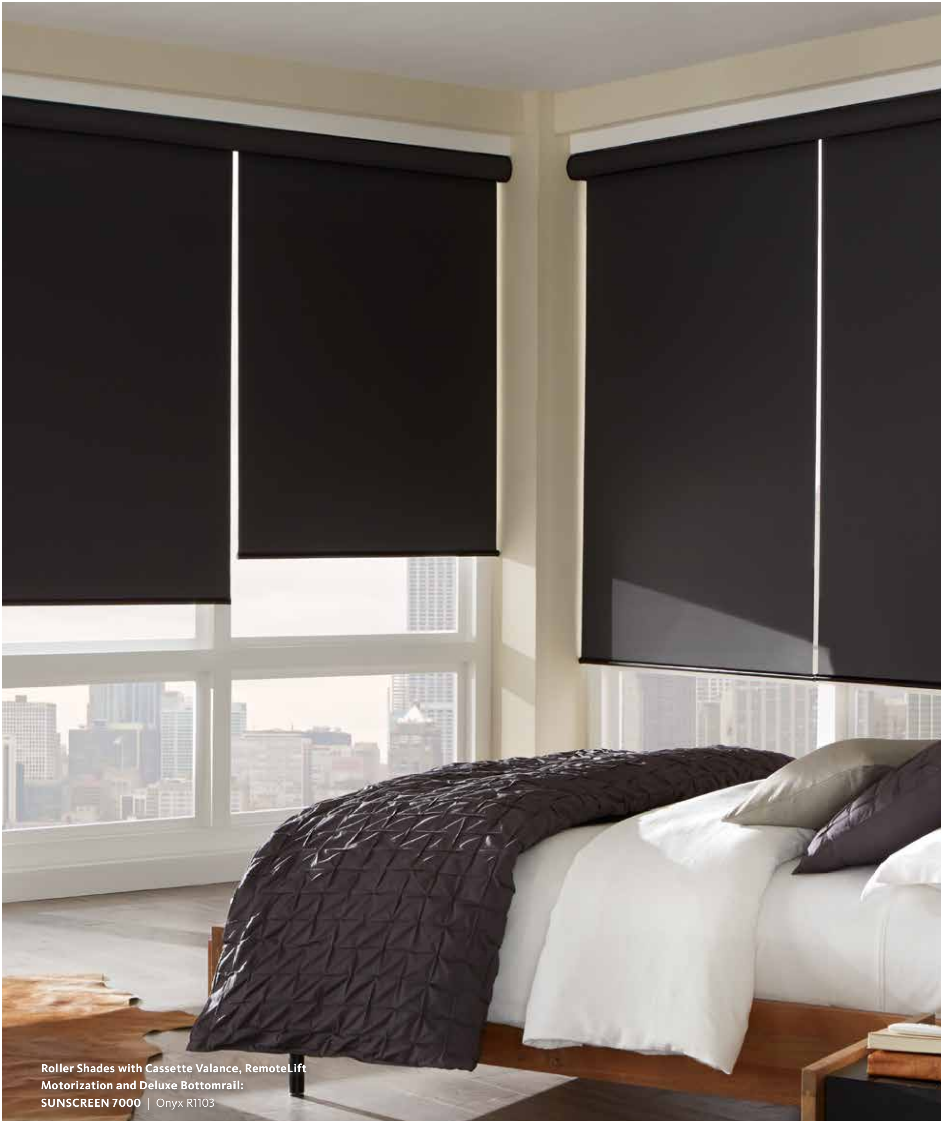
Roller Shades with Cassette Valance, RemoteLift Motorization and Deluxe Bottomrail: SUNSCREEN 7000 | Onyx R1103