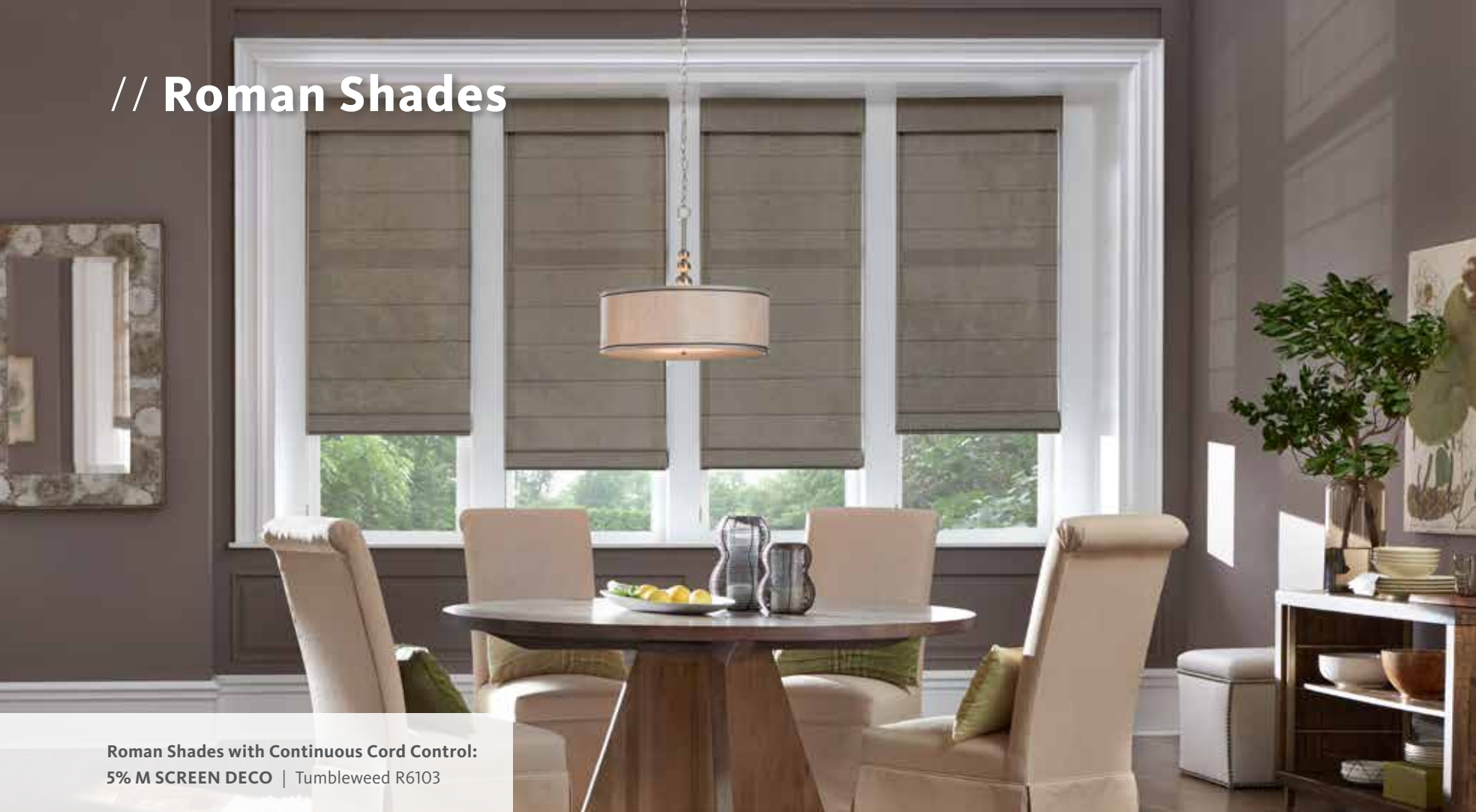
Roman Shades with Continuous Cord Control: 5% M SCREEN DECO | Tumbleweed R6103