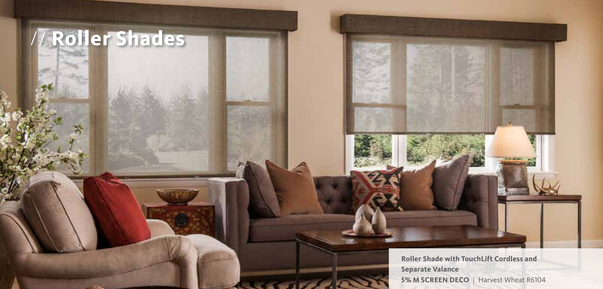
Roller Shade with TouchLift Cordless and Separate Valance 5% M SCREEN DECO | Harvest Wheat R6104