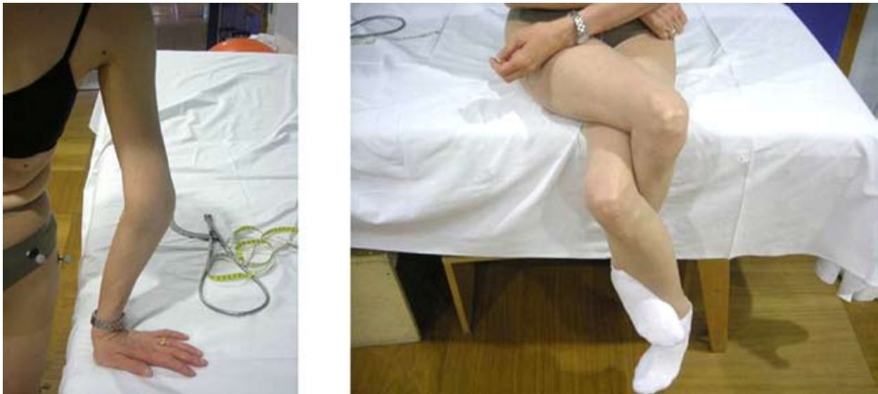
Fig. 2. Patient's contortionism.

be walking or standing or doing a specific exercise or sport activity); to get the baseline they have to measure the time tolerance (time that does not imply pain or fatigue) in two consecutive days, adding it, divide by two and minus 20 per cent. The time obtained is the activity baseline, and every day, a patient may increase the activity by only 1 unit. This measurement is also valid for the exercise number.