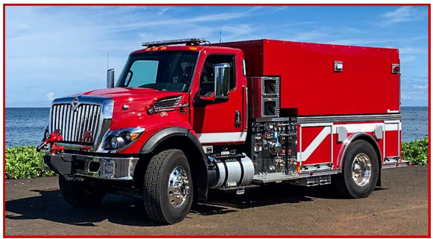
Prototype photo of new water tender