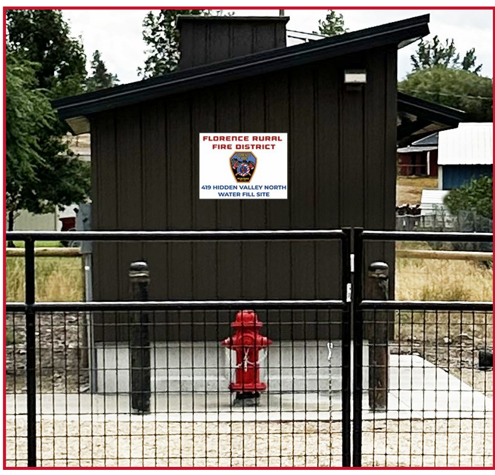
A new water system is located on Hidden Valley North, providing fire units with a reliable water source year round.