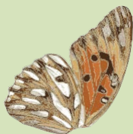
GULF FRITILLARY Agraulis vanillae