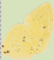
CLOUDLESS SULPHUR Phoebis sennae