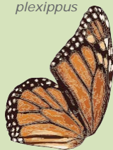
MONARCH Danaus plexippus