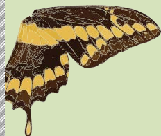
GIANT SWALLOWTAIL Papilio cresphontes