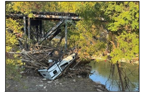
Camper, demolished by the hurricane