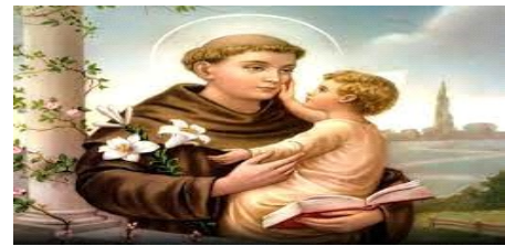
St. Anthony ~ Browns Valley