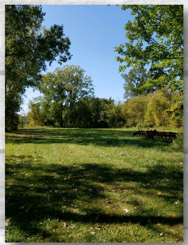
Weddings in the Meadows