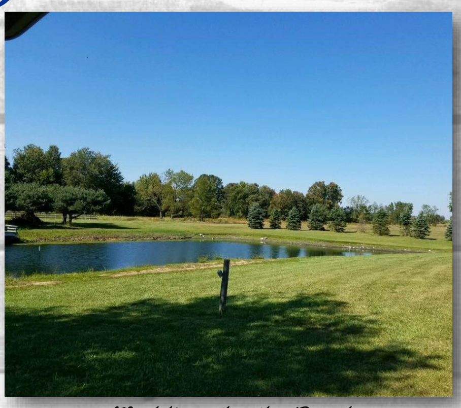
Weddings by the Pond