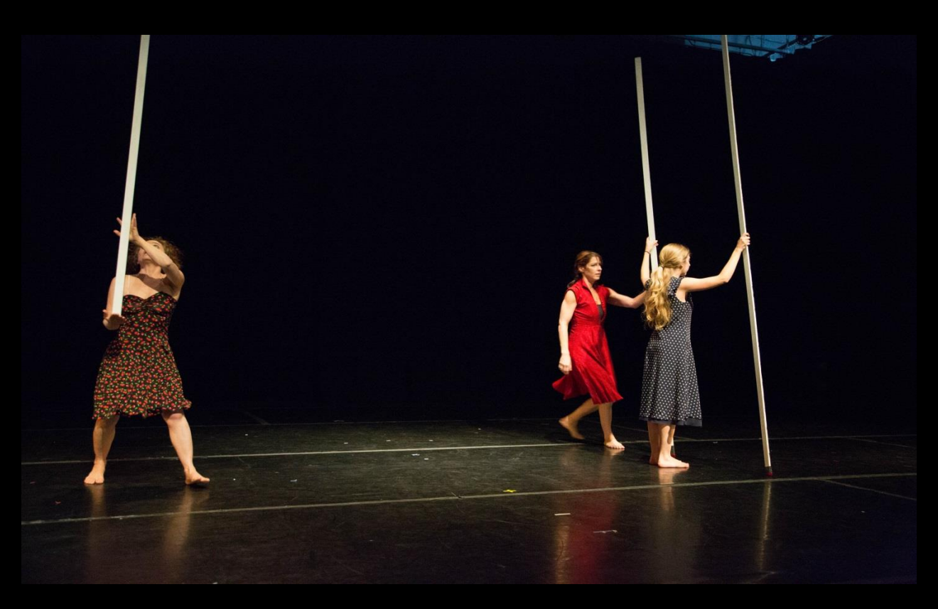
ArtBark International photo Lisa Flory