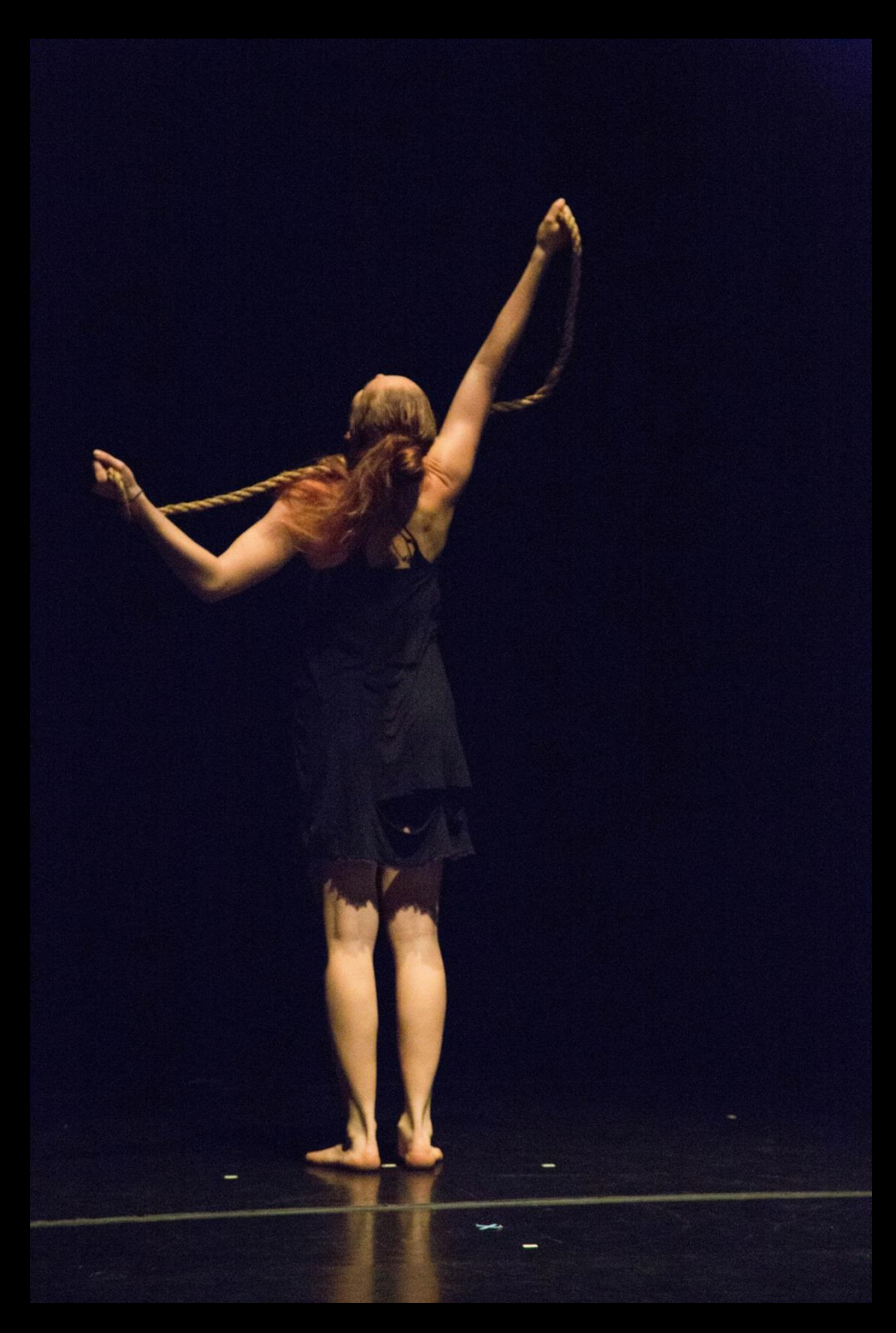
Expressions Dance Company