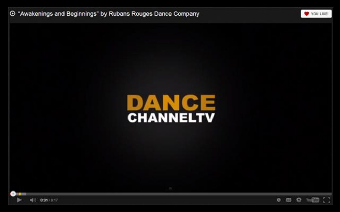
Click on either the image or: <u>Dance Channel TV's Mini Documentary on Awakenings & Beginnings 2014</u>