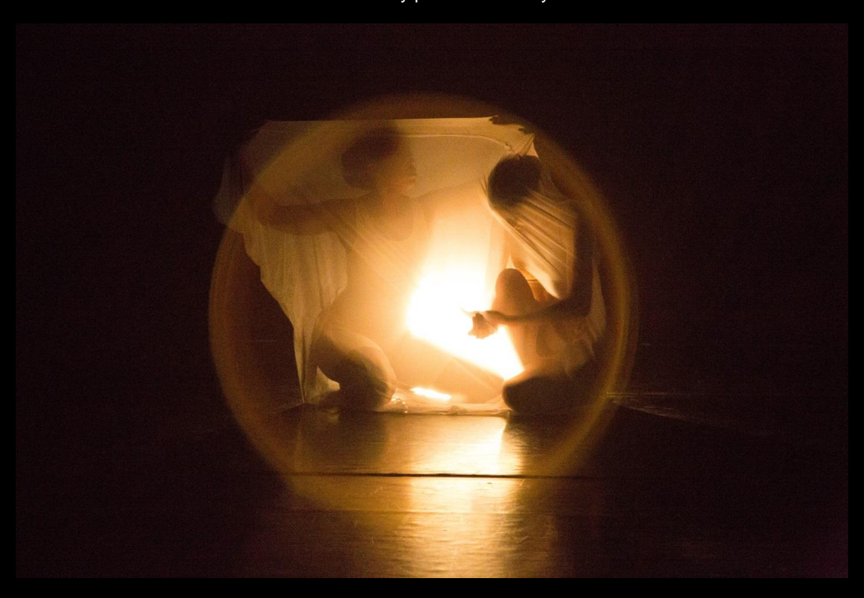
Rubans Rouges Dance Compay