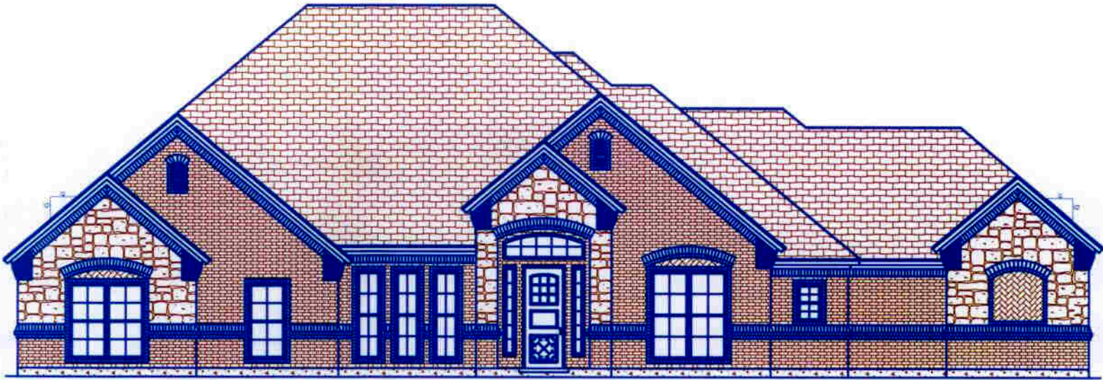
○ FRONT ELEVATION SCALE: 1/4" = 1'-0"