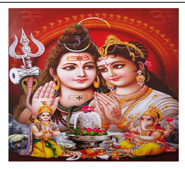
Send your parents names Sponsorship: $126 Yagna Prasadam - Homa Raksha

Reverence and Gratitude Yagnam for Parents May 12th and June 16th, 2019 Time: 10.30am – 12noon