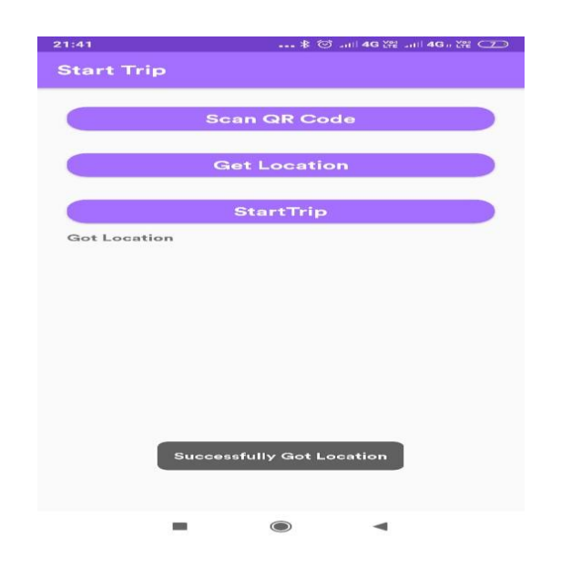
Fig 7 ; Figure Representing The Successful Receiving Of Location