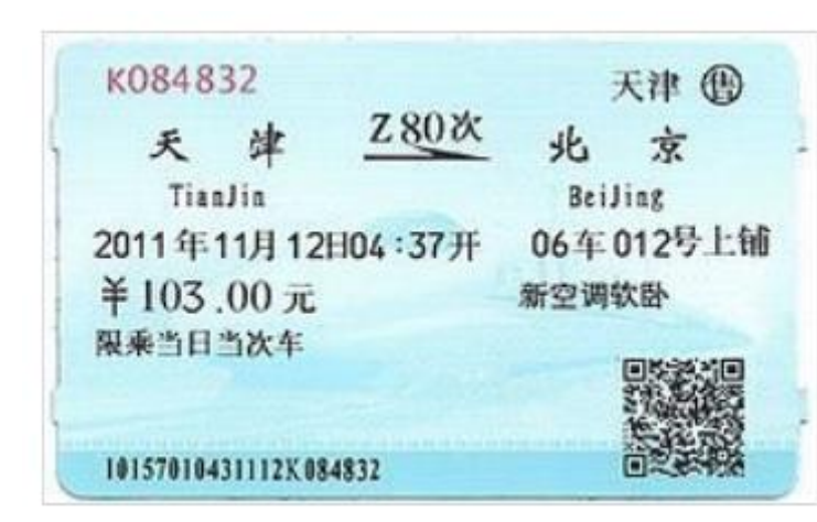
Fig 2; QR Codes Used In Train Tickets In China