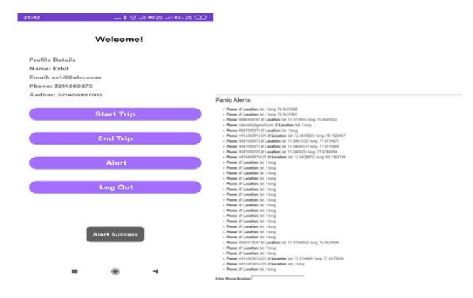
Fig 6; Figure Representing the Successful Sending Of Alert Message