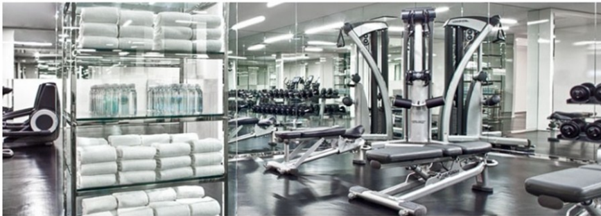
● ● ● DELIVERING CUSTOMIZED AND INTEGRATED CLIENT-ACCESS SOLUTIONS