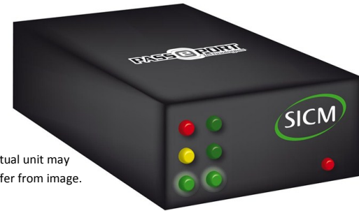
Actual unit may differ from image.