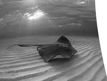
CAYMAN ISLANDS, B.W.I. GRAND CAYMAN · LITTLE CAYMAN · CAYMAN BRAC