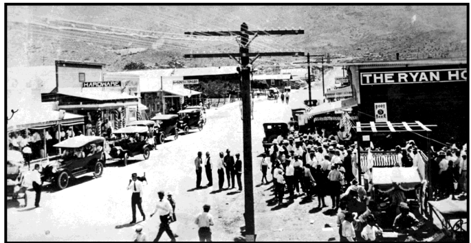
Main street Chloride circa 1912.