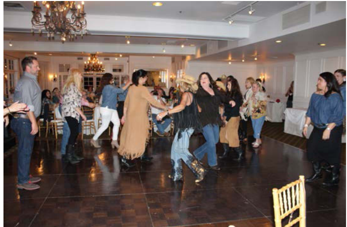
Shin-diggin', toe stompin' members