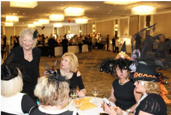
Shown with friends at 2016 "Good Witches" Fashion Show