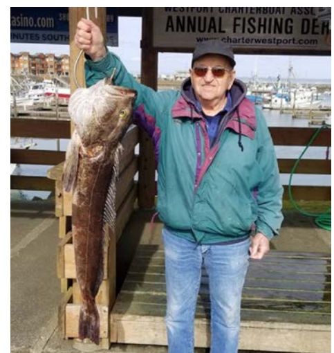
An 18.5 lb. Lingcod was the weekly derby winner earlier this month. The Westport Charter Boat Association sponsors daily, weekly and annual derby prizes.