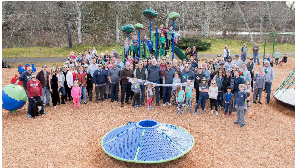
Kids of all ages joined Port Commissioners, Port staff, and playground donors to celebrate the completion of the new Friends Landing playground and the beginning of the 2019 camping season on March 15 th .

Just in time for the 2019 camping season, community members, playground donors and excited kids joined Port of Grays Harbor Commissioners on March 15 th for the ribbon cutting at the new Friends Landing playground.