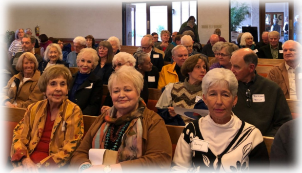
A full house gathered

We have workshops scheduled for Christian Science churches around the state that will allow Care Committee members to serve their fellow church members with more confidence and skill. Please contact your Care Committee if you would like your church to sponsor one for the