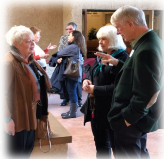
Desert View friends

We have provided more outpatient services, visiting Christian Science nurse cases, and workshops that support Christian Science Church Care Committees throughout Arizona.