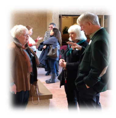
Desert View friends

We have provided more outpatient services, visiting Christian Science nurse cases, and workshops that support Christian Science Church Care Committees throughout Arizona.