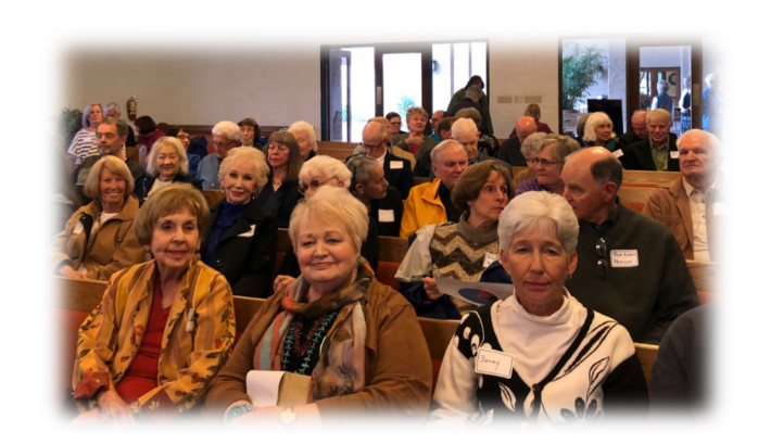
A full house gathered

We have workshops scheduled for Christian Science churches around the state that will allow Care Committee members to serve their fellow church members with more confidence and skill. Please contact your Care Committee if you would like your church to sponsor one for the