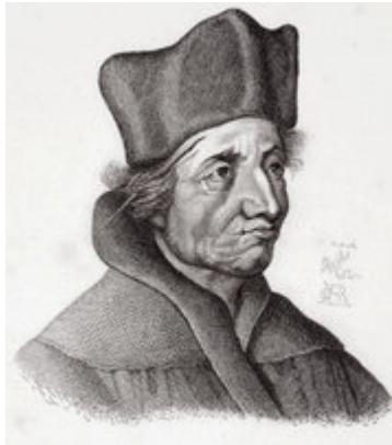
The Papal Theologian Johann Eck

Zwinglians and Sacramentarians into the same group of heretics and enemies of the Catholic Church. 93 Johann Eck had been Luther's friend turned antagonists since the publication of Luther's 95 Thesis, against which Eck had written a refutation tract in 1528. He became the increasing inveterate opponent of the Reformers and Luther's personal antagonists, starting at the Leipzig Disputation in 1519 where he disputed with Luther and Carlstadt; then from Rome he wrote the papal bull Exsurge Domine in June 1520 in which the Pope condemned 41 of Luther's 95 Theses, and threatened the latter with excommunication. Having authored the Papal Bull, Pope Leo X then commissioned Eck to enforce it throughout Germany, which set him on the course of his life as the arch enemy of all the Reformers. But it was his Augsburg Refutation, the Confutatio Pontificia and his 404 Articles that frightened both Luther and Melanchthon so terribly, and instigated them to wipe out all AnaBaptists in a blood furry unknown even to Rome, just to prove that Lutheran's were more like Catholics than AnaBaptists or other reformers such as Zwingli, and hence, Lutherans could be rated as the lesser of two evils; and thus be tolerated as long as they would unite with Rome in one important issue far more important than their feigned belief in justification by faith alone. That united strategy was a consortium of religious hatred and violence in murdering God's people wherever they might be found.