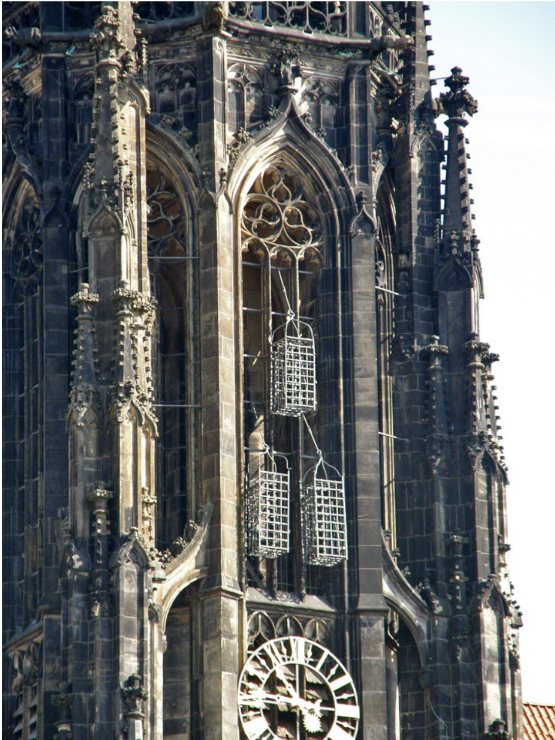
AnaBaptists Cages on Steeple of St. Lambert's Church

Thus, because of their having baptized Catholics and Lutherans, they were falsely called AnaBaptists, even though they never professed to be such, and openly called themselves Covenanters. All three were tortured to death on Saturday, January 22, 1536 and their bodies hung inside of iron cages, suspending from the outside steeple of St. Lambert's Church, which cages are there to this day, as tokens of the Catholics' and Lutheran's hatred of the AnaBaptists.