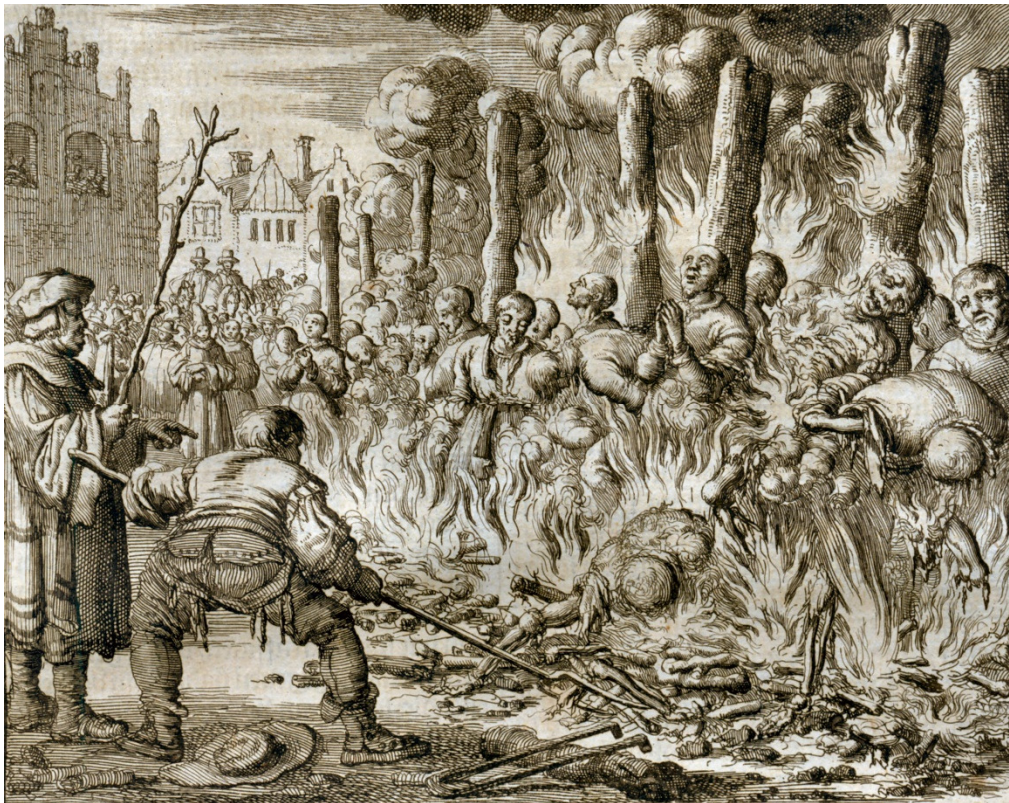
Eighteen AnaBaptists Burned in Salzburg 1528

• Eighteen AnaBaptists were burned to death in Salzburg that same year. 80