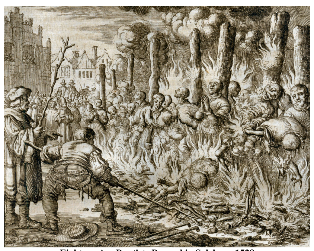
Eighteen AnaBaptists Burned in Salzburg 1528