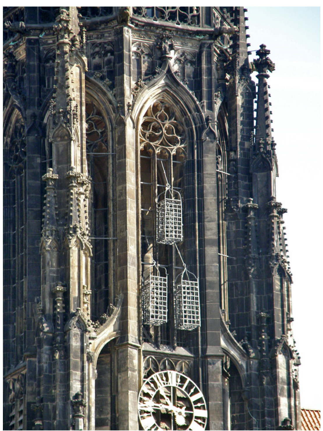
AnaBaptists Cages on Steeple of St. Lambert's Church

Thus, because of their having baptized Catholics and Lutherans, they were falsely called AnaBaptists, even though they never professed to be such, and openly called themselves Covenanters. All three were tortured to death on Saturday, January 22, 1536 and their bodies hung inside of iron cages, suspending from the outside steeple of St. Lambert's Church, which cages are there to this day, as tokens of the Catholics' and Lutheran's hatred of the AnaBaptists.